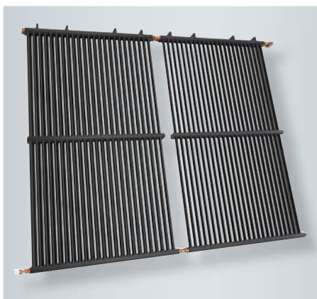
Solar air absorber as a direct heat source for the heat pump or for regenerating the ice store