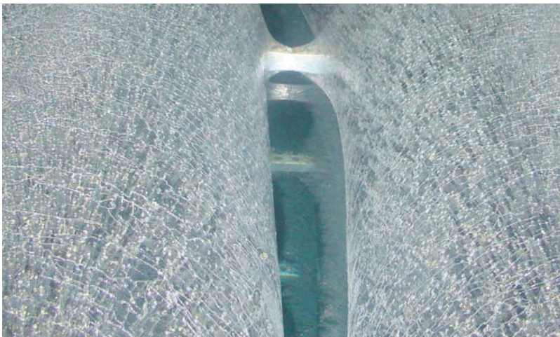
Ice formation around the heat exchanger in the ice store

A further benefit of the Vitofriocal ice store system: it does not require the costly drilling that is needed for tapping geothermal energy from deep in the ground, or the extensive groundwork involved when laying geothermal collectors over a large area. Nor does it require any official permits, as the ice store has no impact on groundwater.