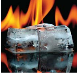
Heating with ice